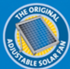
Curb-mounted commercial unit (20 watt)