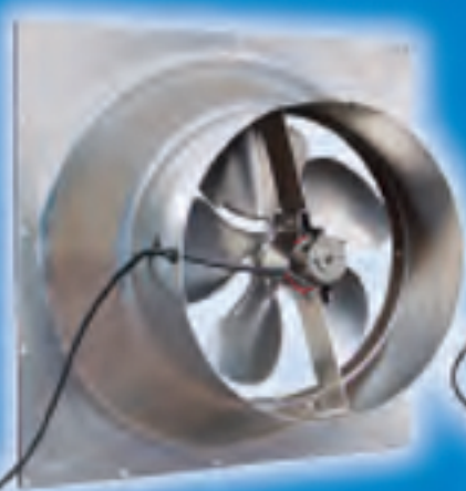
Gable-mounted unit (10 or 20 watt)